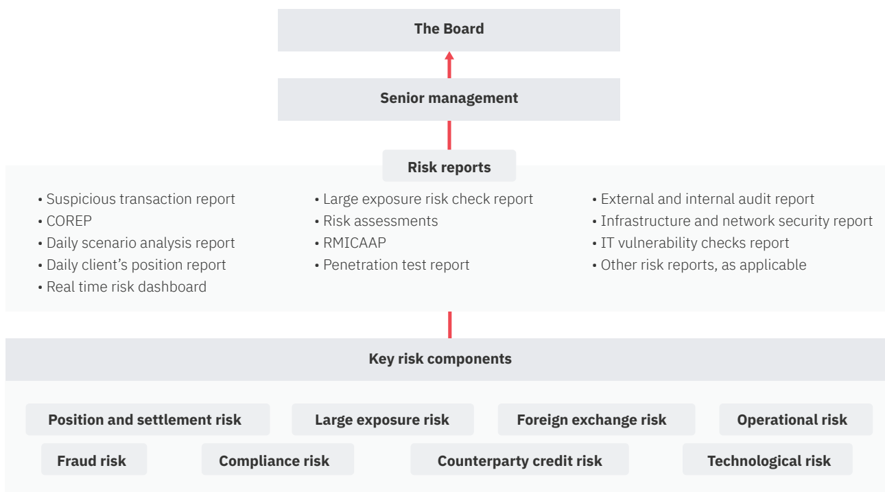
Diagram 2. Risk information flow to the Board

The following describes our risk reporting flow: